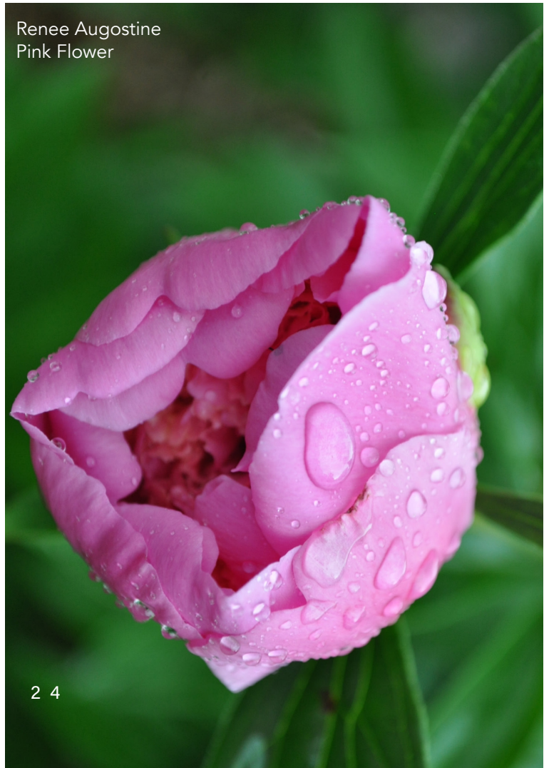
Renee Augustine Pink Flower

and turned her knees to the side and glanced to see that all was right from toe to underpants then turning to her mirror she rambled through her jewelry box flashes of silver and gold like tiny fish in the sun swam through her long thin fingers until her eye caught the specific one and holding it up to her ear she clipped it on then the other and quizzically she stared past the surface glare deep into the mirror's third dimension and